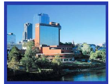
Beautiful Peabody Hotel located in Downtown Little Rock