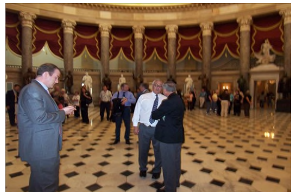
Chatting on the floor of the U.S. Capitol Rotunda.