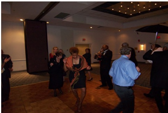
Dancing the night away!