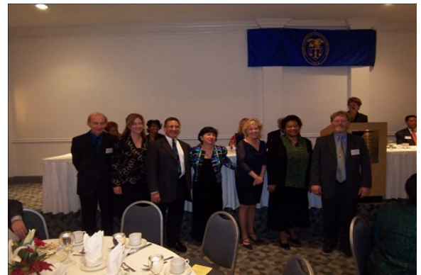
NAALJ Officers and Board