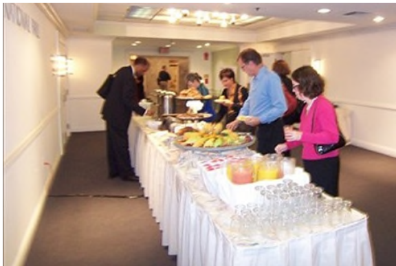
Delicious food galore!