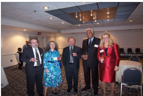
Relaxing after the banquet